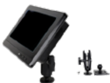
Ball-head bracket installation