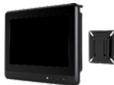
Wall mounted installation